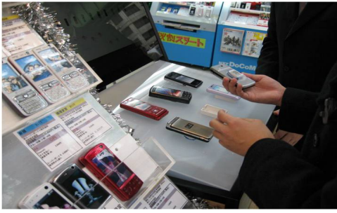
Fig. 1. A Display with Items and Monitor from the Akihabara Experiment

phone in their hand before placing it back on the display. This data transmitted by the nodes was gathered by a network bridge between the sensor network and the in-house network of the shop, which transmitted that data to a central unit to be analyzed for the ranking system. The resulting rank of a specific object was created measuring user interest in the phone by analyzing the output of the vibration and light sensors on the node and thereby deducing the amount of time that users interacted with that phone as compared to others on display.