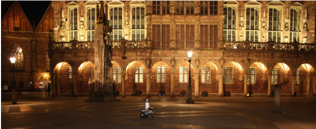
Figure 2: IRMA3D in front of the town hall scanning the city square of Bremen.

Irma3D (Intelligent Robot for Mapping Applications in 3D) is an autonomous robot; see Fig. 2. Its main sensor is a Riegl VZ-400 laser scanner. A typical 3D laser scan needs 3 minutes, producing up to 20 million highly precise 3D measurements of the surrounding. A globally consistent scan matching is used to merge the 3D scans to a single scene [1]. Irma3D is built of a Volksbot RT-3 chassis; it uses the Xsens MTi IMU and odometry to sense its own position.