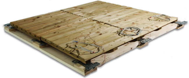
Figure 3. Construction with floor tiles and load sensors.

We built a small construction of four wood tiles, arranged in a 2x2 field. We attached one load sensor under each corner, so that the sensors form a 3x3 grid. The sensors are attached to the two amplifier circuits, which in turn are connected to the iSense sensor nodes. The floor tiles with the load sensors as the under-construction is shown in Figure 3.