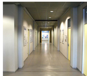
(a) The installation site.

The floor consists of square floor tiles with a side length of 60 cm each, which are installed on small metal columns.