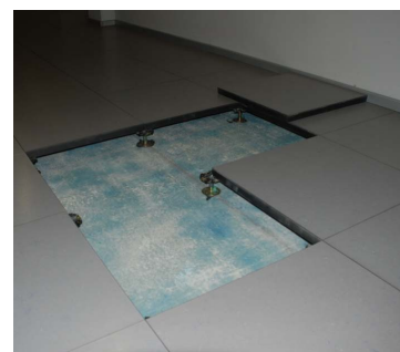
(b) Floor tiles rest on columns.