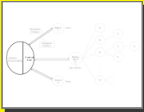
DAPPER distributing PLACE-BOX tasks among several workstations

DAPPER parallelises the sequential placement tool PLACE-BOX and integrates it into the PCB design system THEDA. The resulting system cuts development time so that the same high-quality PCBs can be produced faster.